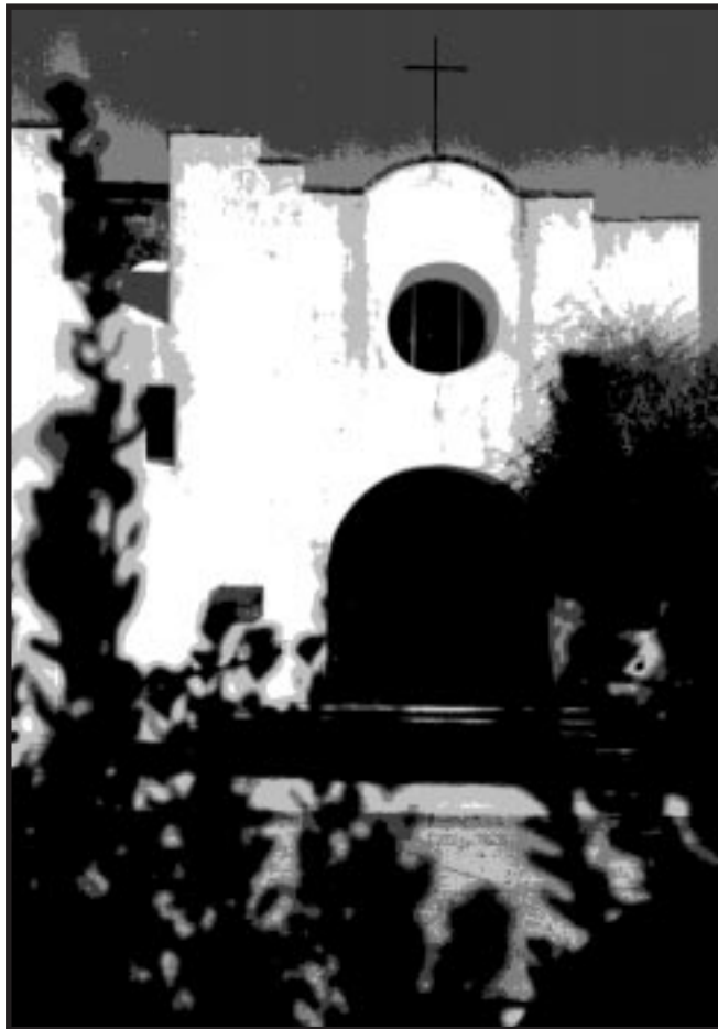
St. Philip's in the Hills Episcopal Church Tucson, Arizona Choral Series